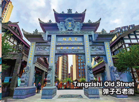
Tangzishi Old Street 弹子石老街