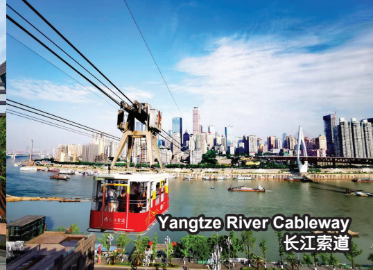
Yangtze River Cableway 长江索道