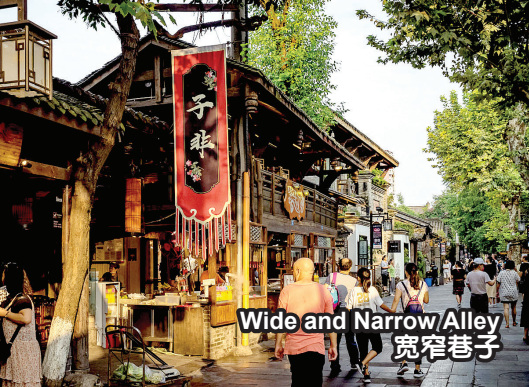
Wide and Narrow Alley 宽窄巷子