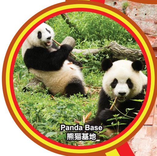
Panda Base 熊猫基地