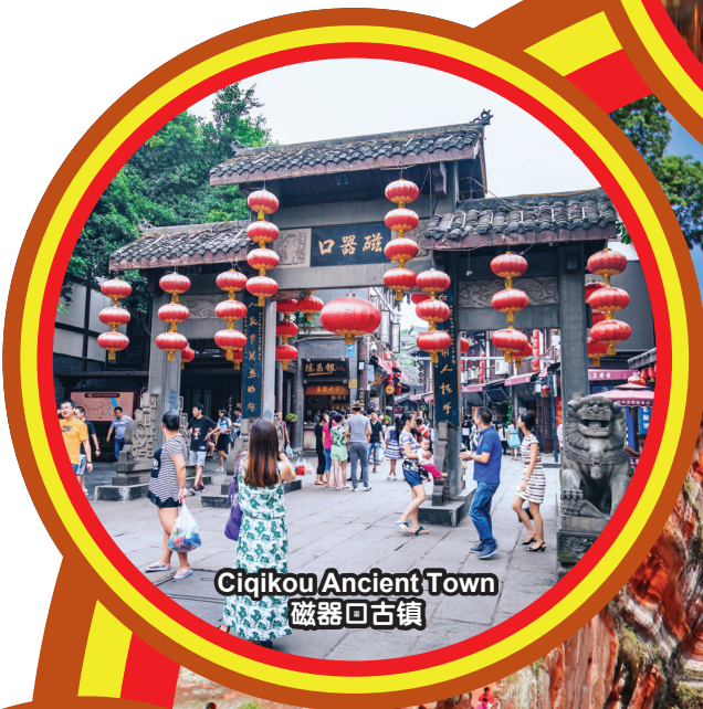
Ciqikou Ancient Town 磁器口古镇