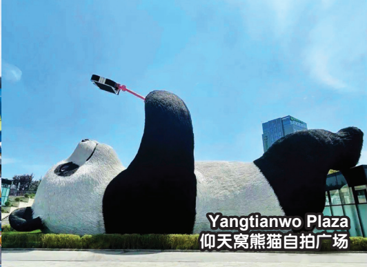
Yangtze River Night View 朝天门熊猫自拍广场