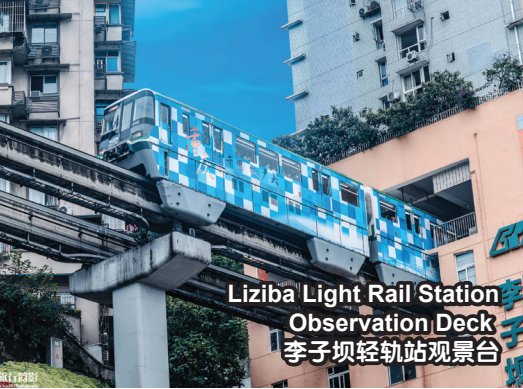
Liziba Light Rail Station Observation Deck 李子坝轻轨站观景台