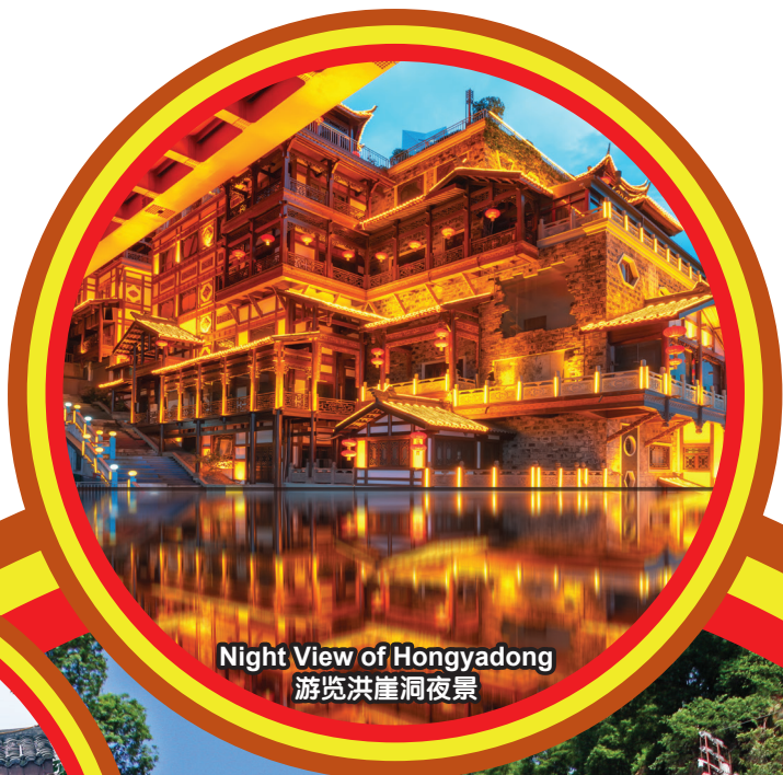
Night View of Hongyadong 游览洪崖洞夜景