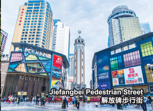
Jiefangbei Pedestrian Street 解放碑步行街